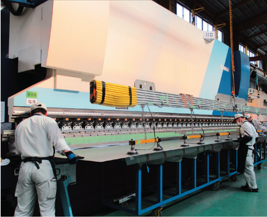
One of the largest bending machines in the industry

Kikukawa's proprietary bending machine achieves 8 meter long bends with a single operation. In combination with our expertise and craftsmanship, difficult or complex bending including curvatures, nonparallel bending and corrugation is available for outsized metal sheets. This high precision metalcraft is sought for high-end projects requiring minimal joints.