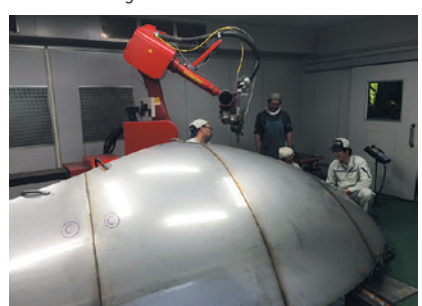
Accommodates large and dual curved products