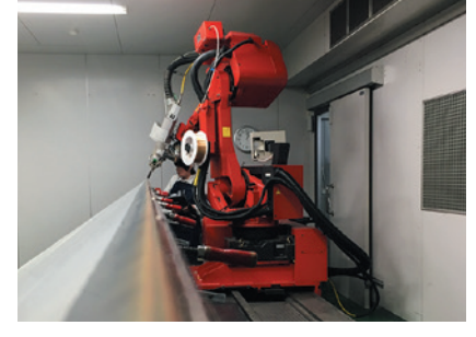
Applicable to outsized mirror-polished stainless steel

Kikukawa provides high quality welding on outsized and dual curved products with fibre laser welding in combination with our expertise. With high intensity lasers and robotic arms, this technology achieves small beaded welds with high strength and minimal heatinduced distortion or discoloration. This solution is sought for high-end construction projects requiring complex shapes, minimal joints and high-quality finishes. Accommodates welding of dissimilar metals and experimentation.