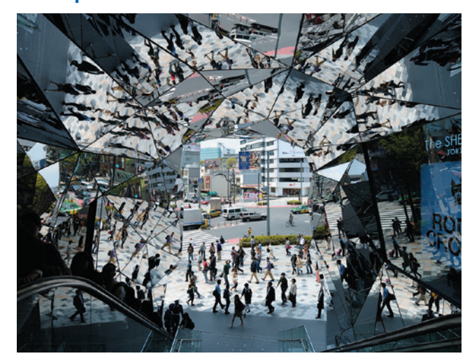
Tokyu Plaza, Omotesando Harajuku Kaleidoscopic Exterior Panel (Stainless Steel)