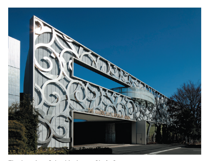
The American School in Japan, Chofu Campus Decorative Exterior Gate (Stainless Steel)