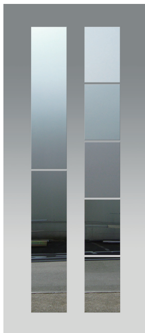
L: Silky Blast gradient pattern spanning two panels