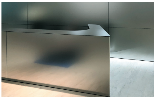
The uniform Silky Blast of the countertop panel enhances the overall sense of coherence