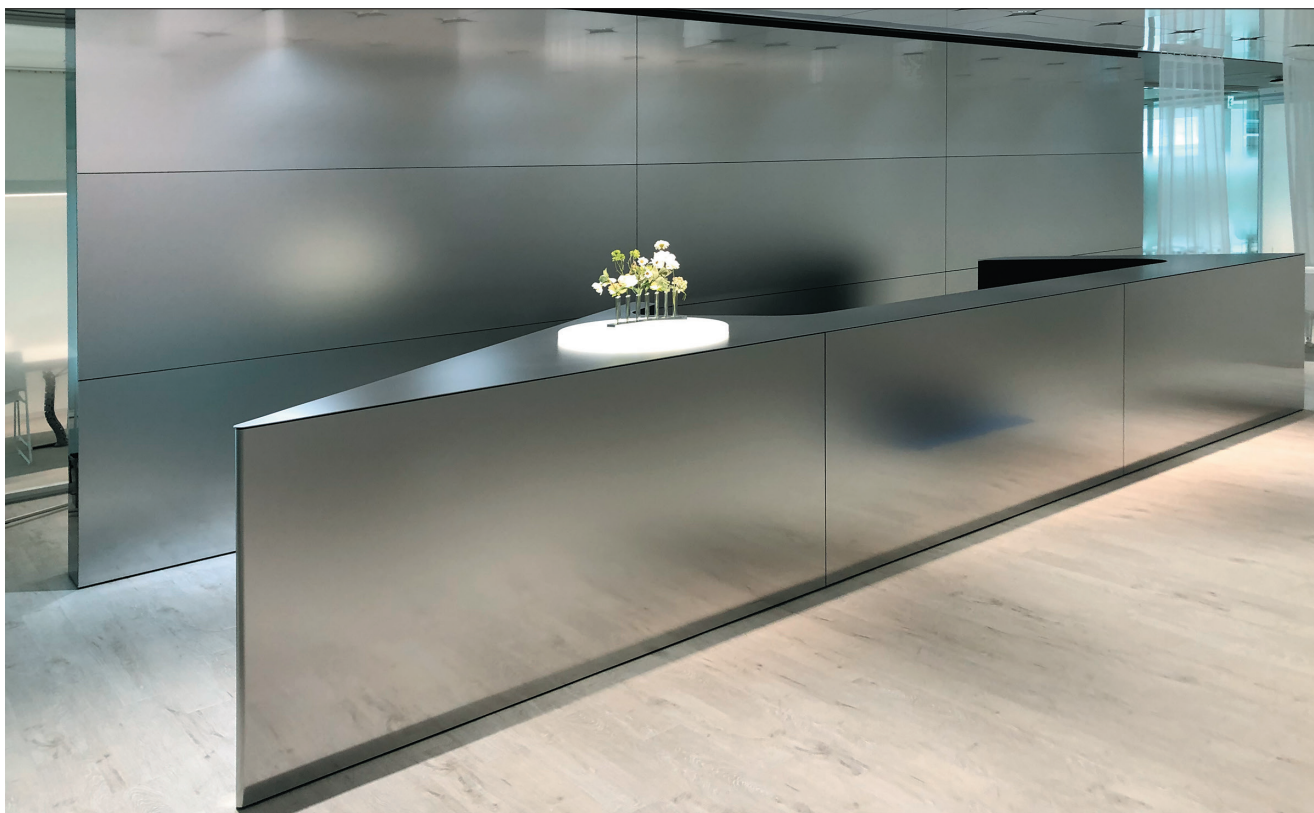
Reception counter and freestanding back wall made with Silky Blast gradient patterned panels. The faintly reflective surface variations create a pleasing visual effect