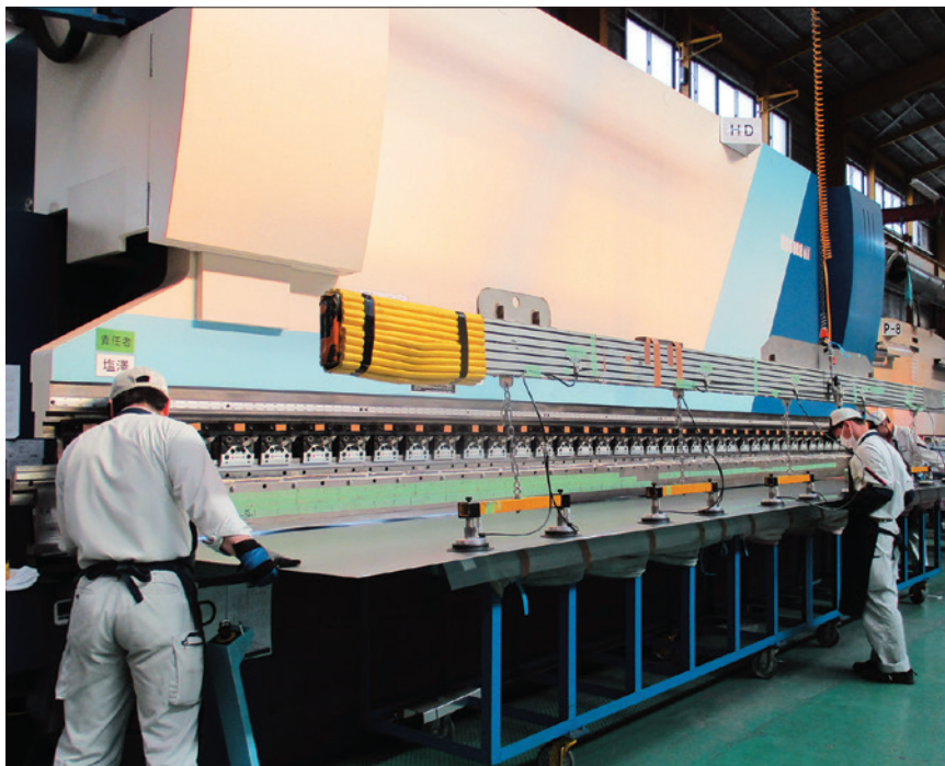
One of the largest bending machines in the industry

Kikukawa's proprietary bending machine achieves 8 meter long bends with a single operation. In combination with our expertise and craftsmanship, difficult or complex bending including curvatures, nonparallel bending and corrugation is available for outsized metal sheets. This high precision metalcraft is sought for high-end projects requiring minimal joints.