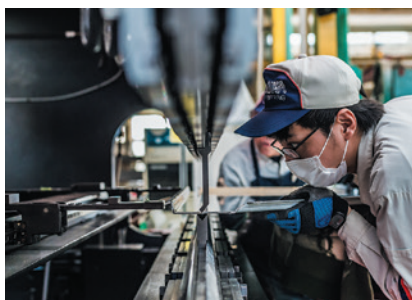
High quality bending achieved with craftsmanship and expertise

(Please consult with us about larger sizes)