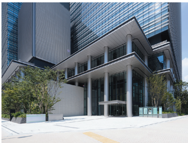
Otemachi Place Southeast Entrance Round Column Covers (Aluminium)