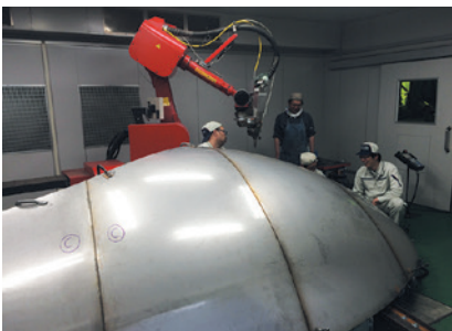
Accommodates large and dual curved products

1200mm (W) x 7000mm (L) x 1300mm (H) (Please consult with us about larger sizes)