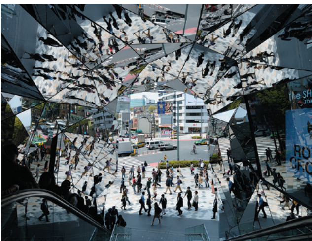
Tokyu Plaza, Omotesando Harajuku Kaleidoscopic Exterior Panel (Stainless Steel)