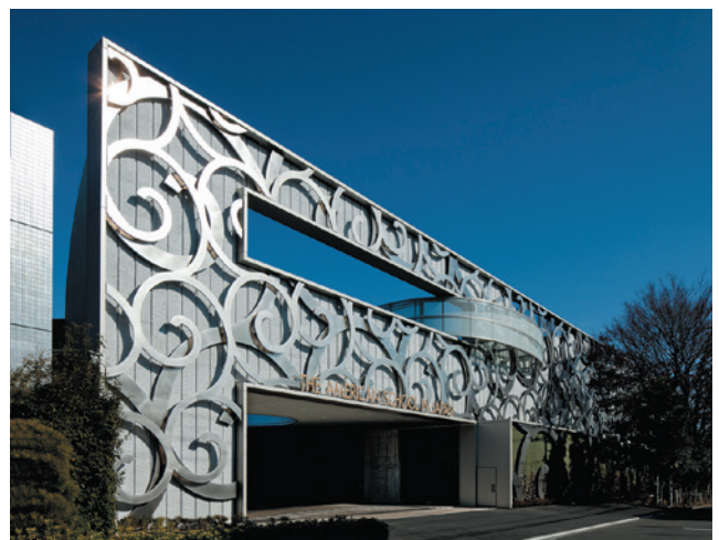
The American School in Japan, Chofu Campus Decorative Exterior Gate (Stainless Steel)