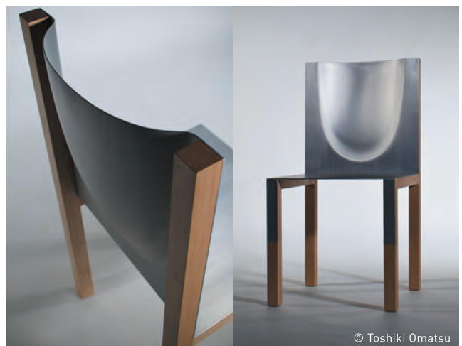
"Shades of Michelangelo" by Kuwasawa Design School and KIKUKAWA Chair (Aluminium)