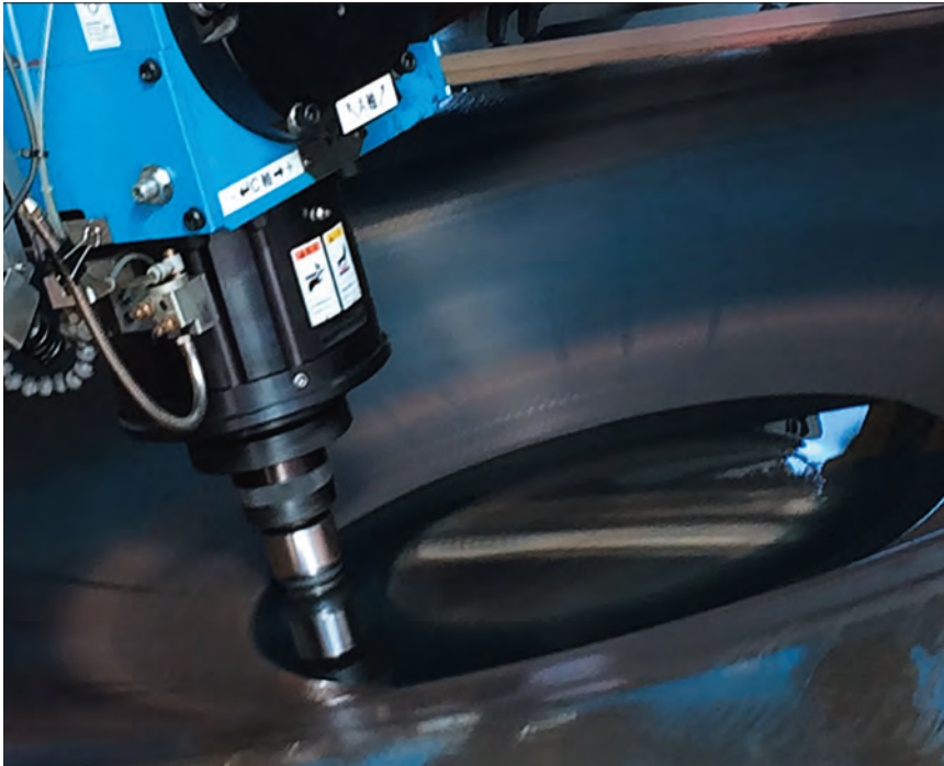
A rotating forming tool applied localized pressure to achieve the desired shape

In combination with our expertise, Kikukawa optimizes the production of small lots of high variety product lines with incremental forming, a versatile dieless sheet forming technology. The desired shape is achieved by applying localized pressure on a thin sheet metal thus complex shapes that were difficult with conventional deforming methodologies are accommodated. Design or shape revisions and prototype productions are accommodated.