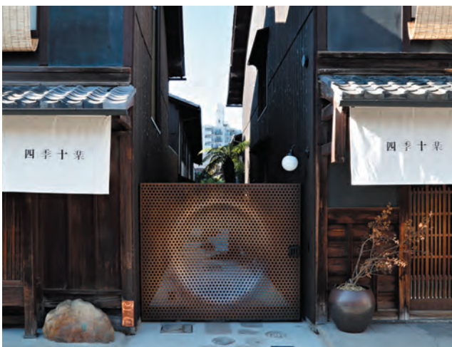
Shiki Juraku Bespoke Gate (Copper Alloy)